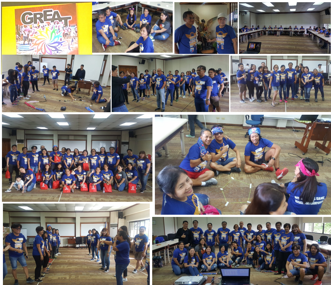
Growing and Expanding Achievements through Teamwork! STSRO Team Building 2018 Tagaytay City (April 26, 2018)