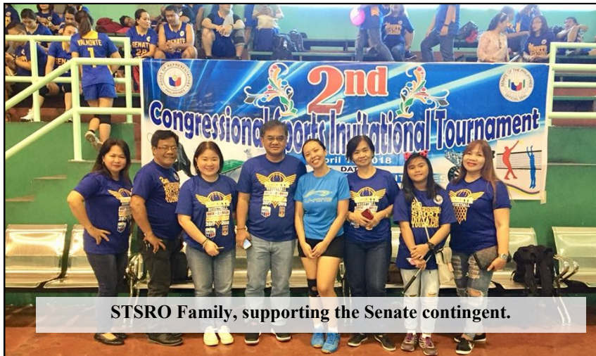
STSTRO Family, supporting the Senate contingent.