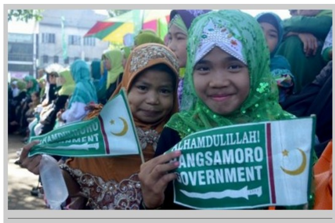
Muslim girls participate in celebrations in Cotabato City ahead of the signing of the Comprehensive Agreement on the Bangsamoro

Authority of the Commissioner Prescribe Additional Procedural or Documentary Requirements. The Commissioner may prescribe the manner of with compliance any documentary procedural requirement in connection with the preparation of or statements accompanying the tax returns."