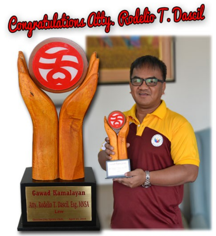
in recognition of his contribution and service in the field of Law

given by Quezon City, Kabataang Barangay Alumni Association on April 15, 2015 at Quezon City Sports Club Quezon City