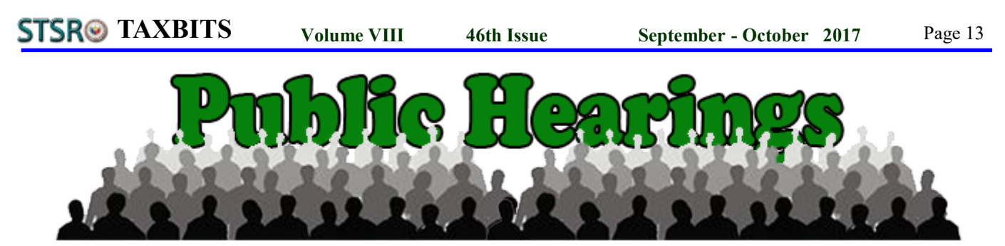
September - October 2017