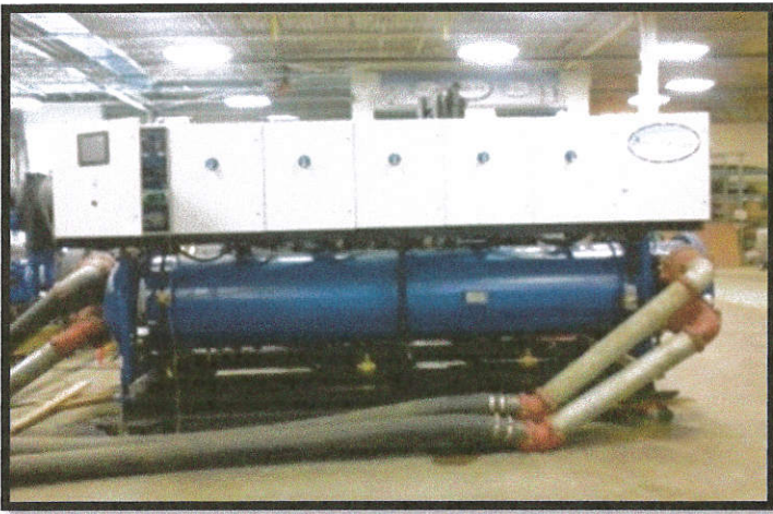
The new chiller system at the Electro-Mechanical area.