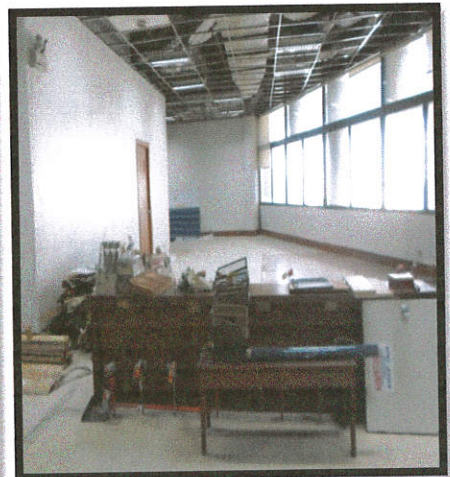
Legislative Cash Management Service