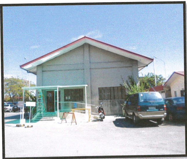
Façade of the Senate Canteen currently undergoing renovation.