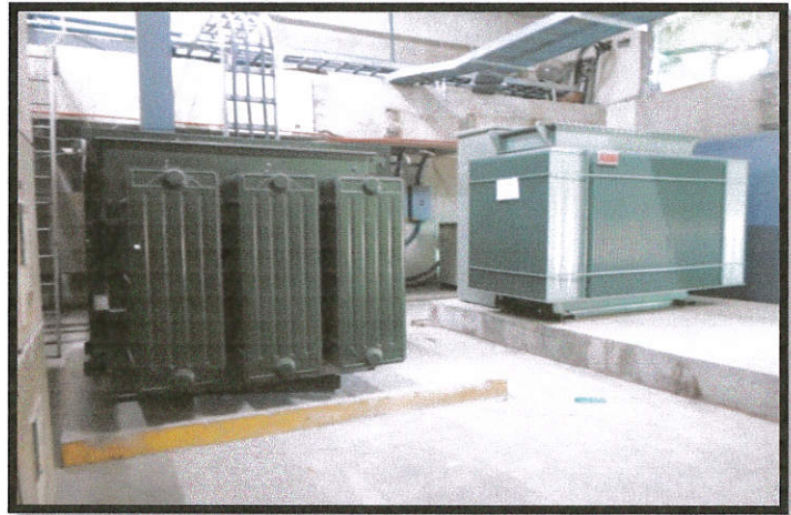
The existing transformer (left) and the newly installed compartmental type transformer (right) located at the Electro-Mechanical area.