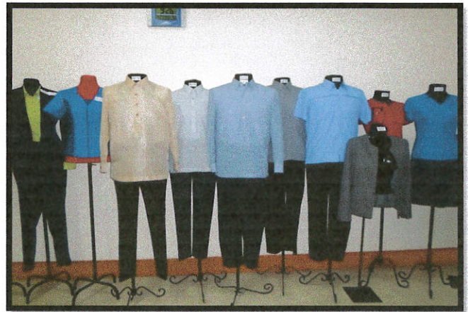
Bidding conducted for the Male and Female Secretariat Uniform for CY 2015.