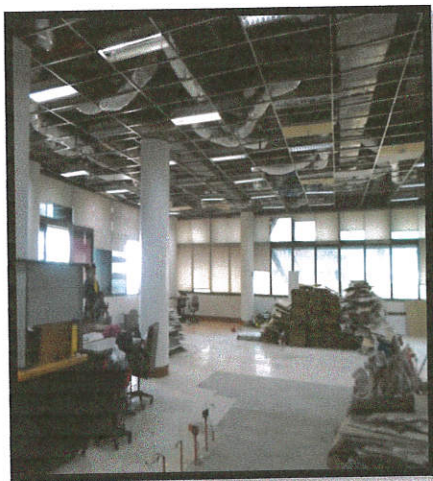
Legislative Accounting Service

Offices under the AFS which are due for renovation. Property and Procurement Service (PPS) is also included in the project.