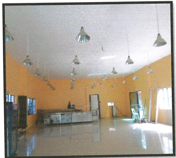
The interior of the Senate canteen still undergoing renovation.