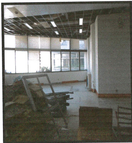
Legislative Budget Service